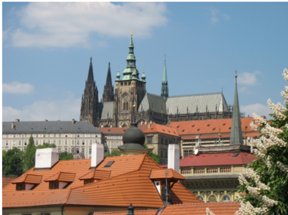
St. Vitus Cathedral, Prague Castle, Prague, Czechia